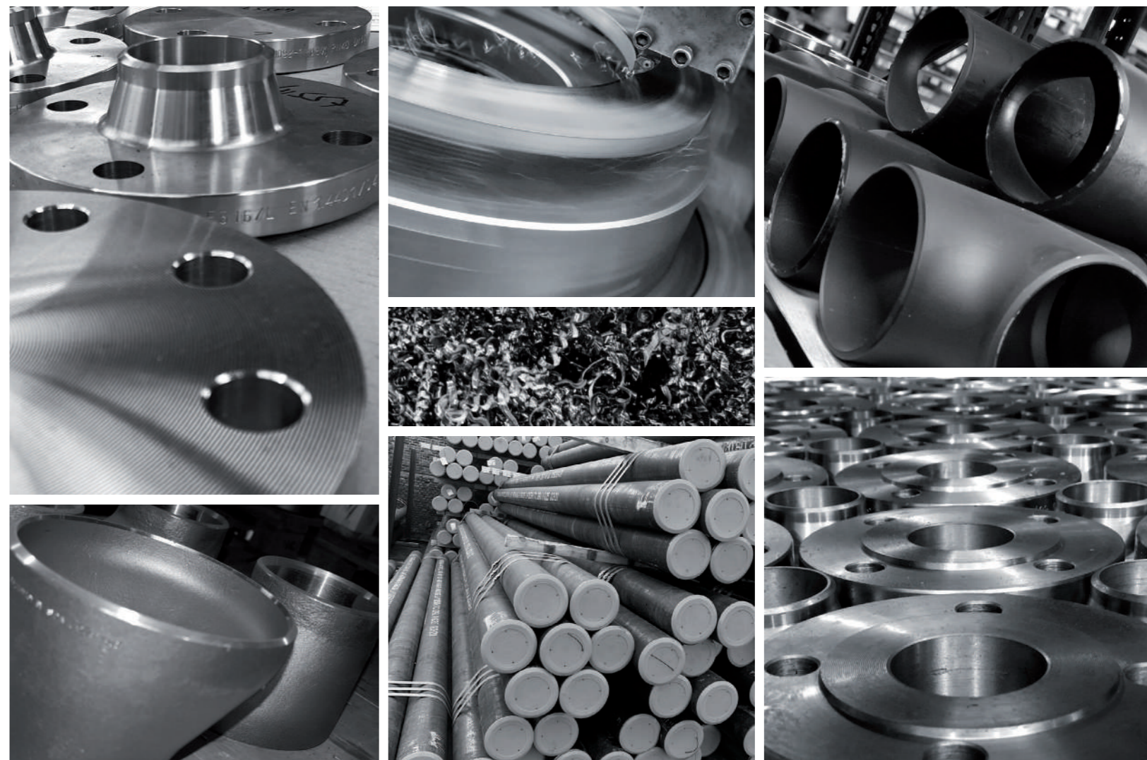
Conception : CHRISTOPHELUXDESIGN (www.christopheluxdesign.com)